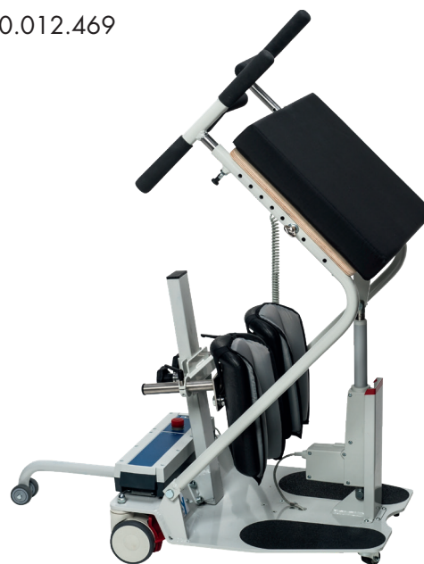
Abb. zeigt Zubehör